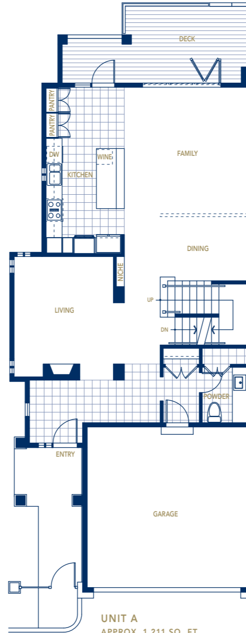
UNIT A APPROX. 1,211 SQ. FT. LEFT | MAIN